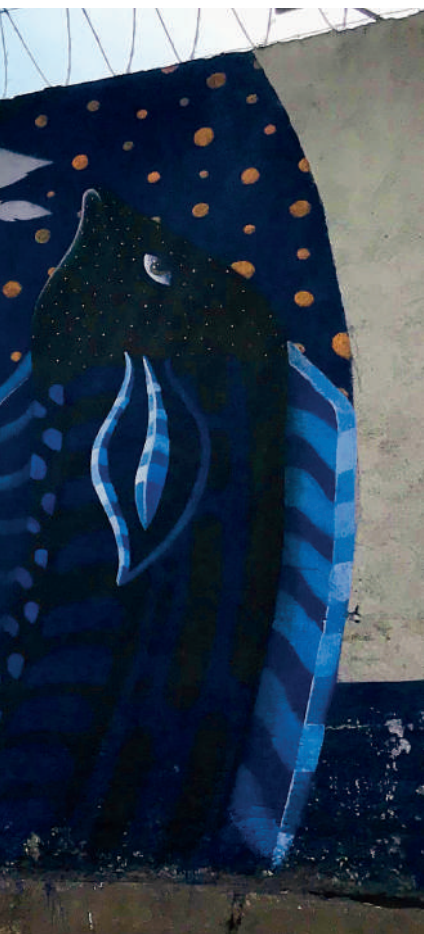
Untitled mural with Lesuperdemon, Mexico City, Mexico, 2017