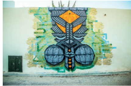
Mural for Djerbahood Project, Djerba, Tunisia, 2015