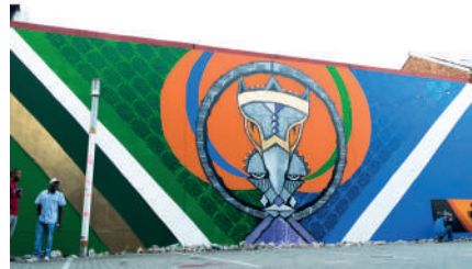
Untitled, Johannesburg, South Africa, 2016