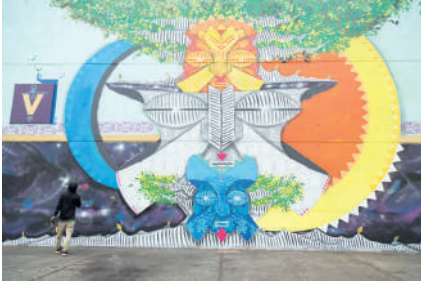
Untitled , Mexico City, Mexico, 2018