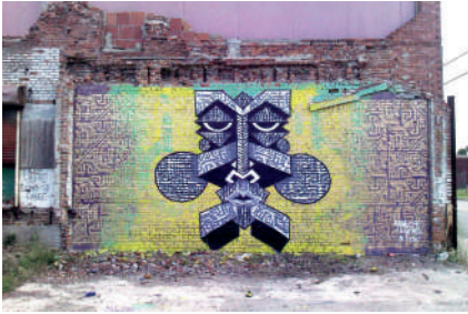
Untitled , Rochester, New York, USA, 2013