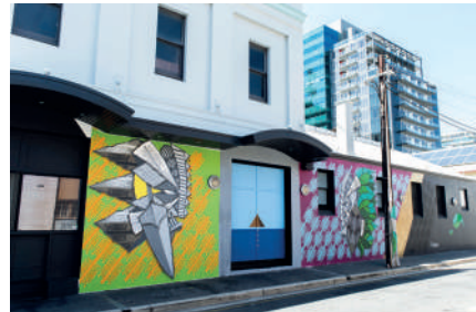
Untitled, Adelaide, South Australia, 2017