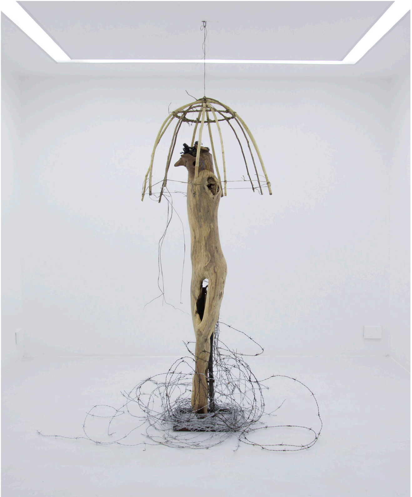
Shabu Mwangi, Wrapped Reality/Self , 2022 Wood, steel support, barbed wire, sisal, dimensions variable