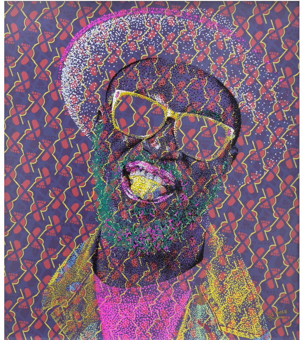
Evans Mbugua, Blinky! , 2018